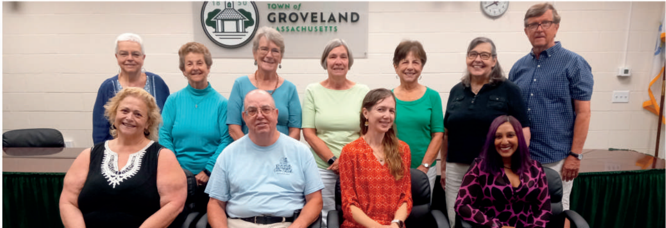
Back Row: Board of Directors of Groveland COA; Front Row: Staff of Groveland COA

The official newsletter of The Groveland Council on Aging