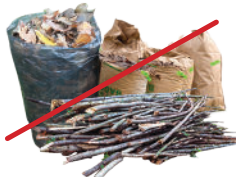
NO Green Waste NO desechos verdes