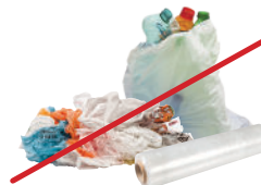
NO Loose Plastic Bags, Bagged Recyclables or Film Empty recyclables directly into your bin. NO bolsas y envolturas de plástico sueltas, o materiales reciclables embolsados Vacié directamente los materiales reciclables en nuestro carrito