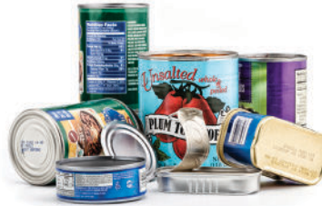
Food & Beverage Cans Latas de alimentos y bebidas