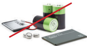
NO Batteries – check local drop-off programs for proper disposal NO baterías - Verifique los programas locales de entrega para su correcta eliminación