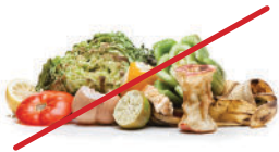
NO Food or Liquids NO comida o líquidos

✗ DO NOT INCLUDE IN YOUR MIXED RECYCLING CONTAINER / NO INCLUIR EN SU CONTENEDOR DE RECICLAJE MIXTO