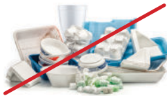
NO Foam Cups & Containers NO vasos y recipientes de poliestireno