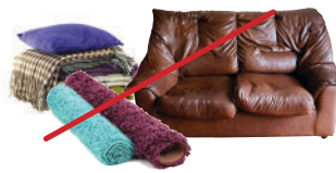
NO Clothing, Furniture & Carpet NO ropa, muebles y alfombras

To learn more, visit: Para más información, visite: