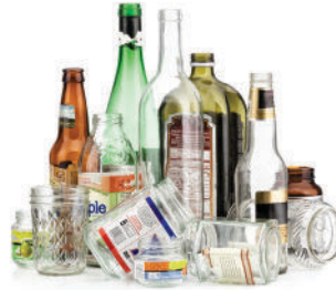
Glass Bottles & Containers Botellas y envases de vidrio

✗ DO NOT INCLUDE IN YOUR MIXED RECYCLING CONTAINER / NO INCLUIR EN SU CONTENEDOR DE RECICLAJE MIXTO