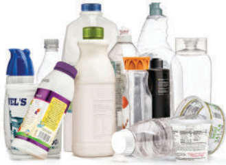
Plastic Bottles & Containers Botellas y envases de plástico