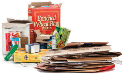
Flattened Cardboard & Paperboard Cartón y cartulina aplastados